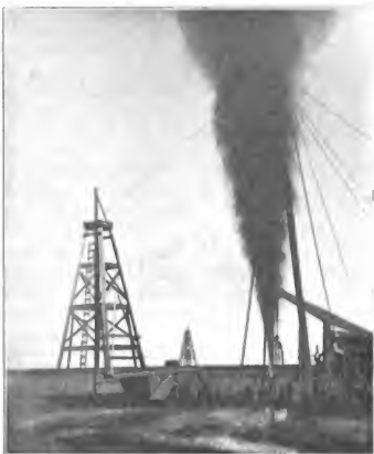
A KANSAS OIL WELL.